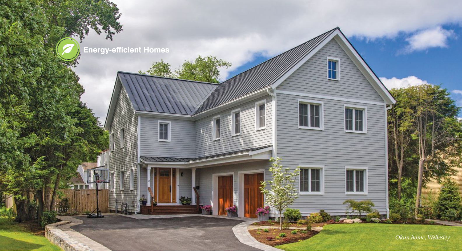
Okun home, Wellesley