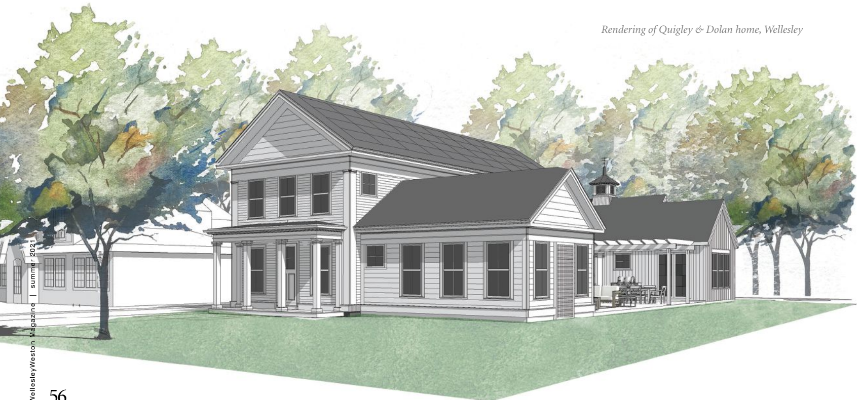
Rendering of Quigley & Dolan home, Wellesley