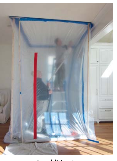
In addition to recommending that work sites be sealed off during repairs, the job-site guidelines included using window fans to create negative air pressure and HEPA vacuums to clear dust at the source.

In addition to controlling energy use, the systems and materials in the house actively promote conservation. In the kitchen, a Tapmaster foot control (www.tapmaster.ca) at the kitchen