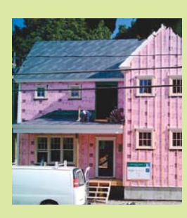
Protect from above The roof is covered